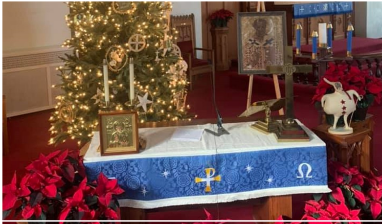
December 24 th Advent Worship - 9:15am