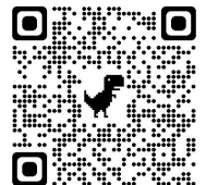
TABLE BLESSING “You Are Holy” Red Hymnal #525

You can also go online at www.zionrockford.com or you can click on the QR code.